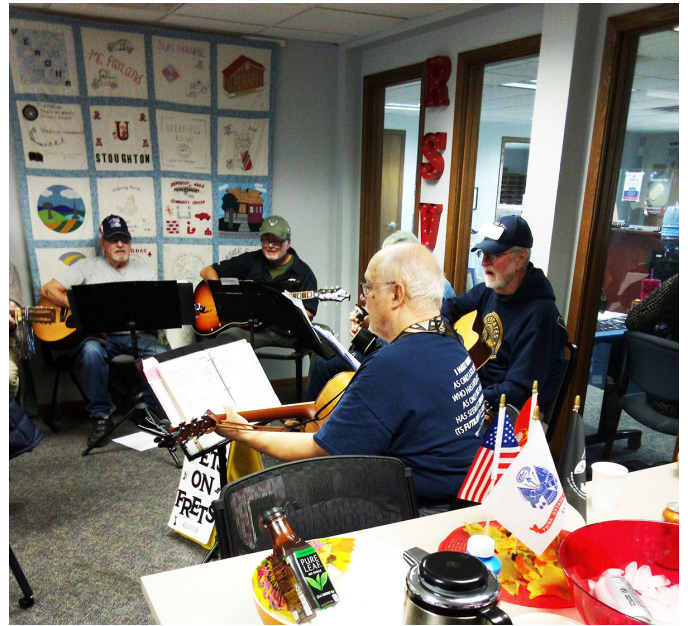
Vets on Frets performs at the RSVP Office on Veterans Day 2024